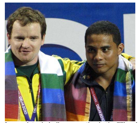
9 years later in India competing in the 77kg class