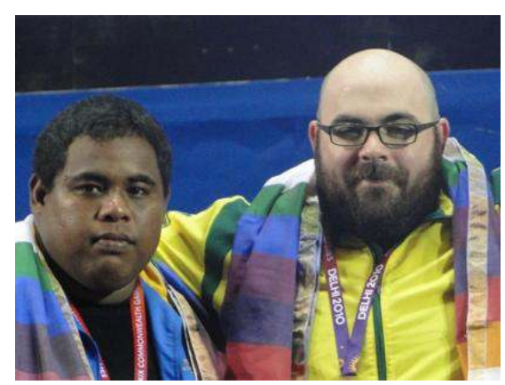
7 years later in India but of course both heavier.