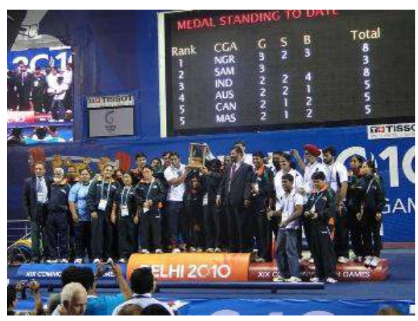
India wins the Trafalgar Trophy for the second time in Commonwealth Games history.